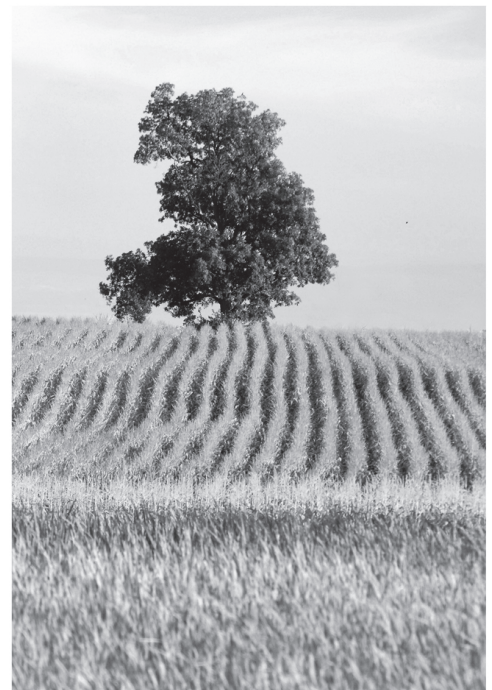
Farm land protected at the Meyer Preserve in Superior Township.

Visitor parking is available at the LeFurge Woods Nature Preserve, owned by the Southeast Michigan Land Conservancy, across Prospect Road from the 84 acre parcel.