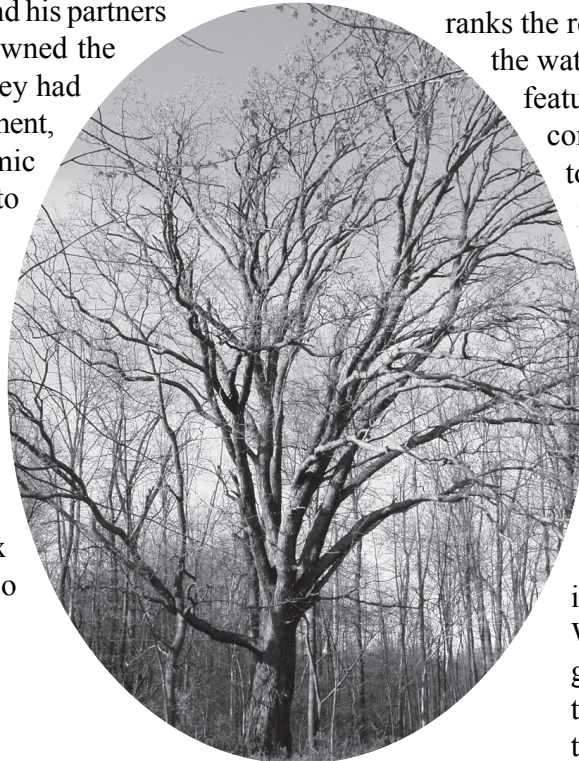
This majestic Swamp White Oak is one of the large mature trees now protected in SMLC's newest nature preserve located in Van Buren Township. It measures over 100 feet tall, and over 6 feet in diameter at its base.

A small tributary of the Huron River flows through the site and the Huron River Watershed Council identified the property as a key site to protect through their Bioreserve Project, which identifies and ranks the remaining natural areas within the watershed. Even with all of these