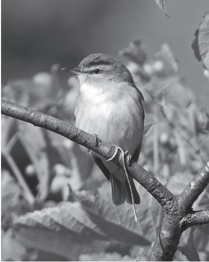
Red-eyed Vireos are regular customers at SMLC preserves like the new one in Van Buren Township.

You won't find any autos lining up this spring at SMLC's newly protected 26 acre “refueling station” in Van Buren Township. Instead you'll likely find a diverse assortment of migrating songbirds stopping over to “gas up” on insect protein and fat for the