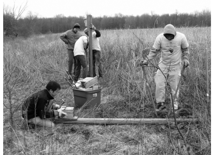
Volunteers repairing and cleaning bluebird nest boxes at LeFurge Woods Nature Preserve in March 2010.

A big Thank You to these volunteers who have been helping with other SMLC stewardship work: to Neil