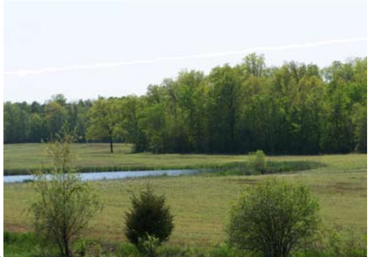
Wetlands, woodlands and fields at the Meyer Nature Preserve in Superior Township.

In August of 2008, the Washtenaw County Parks and Recreation Commission (WCPARC) became the owner of 139 acres in Superior Township, Washtenaw County. The preserve has since been named the Meyer Preserve to acknowledge the family which long held land in the Township. The 139 acres consists of two parcels on Prospect Road at the intersection of Vreeland Road, a 55 acre parcel located northeast of the intersection and an 84 acre parcel to the southwest. The preserve consists mainly of open agricultural land, with about 45 acres of valuable woods and wetlands, and makes a significant contribution to the two mile long Superior Township Greenway.