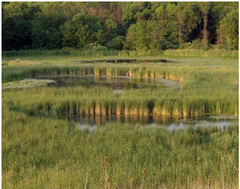
Wetlands at LeFurge Woods Nature Preserve.

survey form. Completed survey forms may be returned by mail, or emailed to info@smlcland.org . Thank you very much for your interest in land conservation!