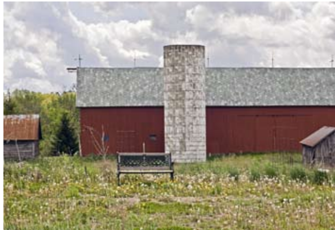
The Conservancy Farm in Washtenaw County serves as a focal point for gardeners, farmers and visitors of the Superior Greenway.

Also in 2005, the Conservancy continued some of the prior farm lease arrangements with local farmers. Today, SMLC continues both of those relationships and has also added 4 additional local farmers to the SMLC farm land use program, 3 of whom are new to the farm in 2009. This year, the farm proper will be fully farmed using organic practices by 5 area farmers and the goal is to have all 99 acres farmed using organic practices within the next several years.