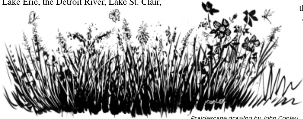
Prairiescape drawing by John Copley

When you hear someone talking about a tall grass prairie it generally conjures up images of Native Americans or early European immigrants living out on the Great Plains. However, Michigan also had extensive prairies that stretched out along the glacial lakeplains of Lake Erie, the Detroit River, Lake St. Clair,