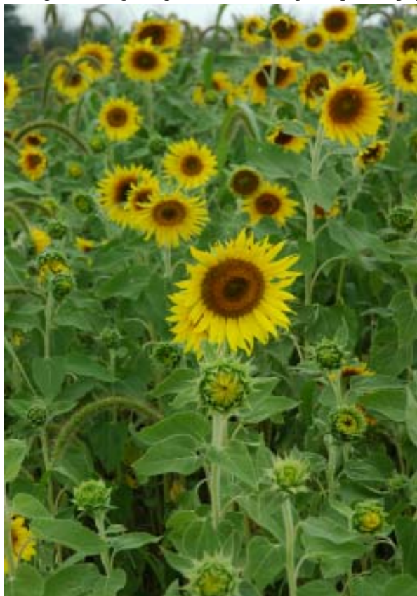
Dozens of sunflowers in the Conservancy Community Organic Garden had birds flocking in by the hundreds

Gardeners are collaborating on a handbook to help people understand how to take care of their plots and grow plants with an organic philosophy. And when the ground warms up again, we'll resume putting up the fence – a project that will benefit from many helping hands.